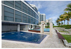
This is What Yankees Star Alex Rodriguez's Miami Apartment Looks Like