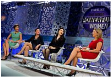
Ex-Obama economic aide: Fear the young unemployed Fortune