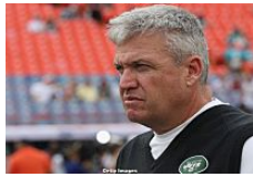
The Rex Ryan Ship is Sinking Fast Scout.com