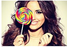
Hot Instagram Pics of Rory McIlroy's Girlfriend Nadia Forde RantLifestyle