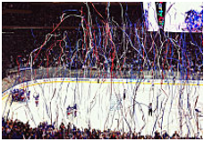
The one item female sports fans should definitely avoid wearing New York Natives